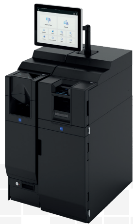
1. Small volume of cash CI-10X

The CASHINFINITY Back-Office range can fit the needs of the hotelier, whether that be volumes of cash or available surface area: