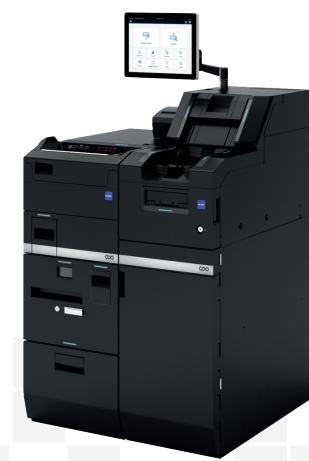
4. Large volume of cash CI-100X

“Especially on a Monday this saves us at least a few hours due to not needing to count and check pay ins.”