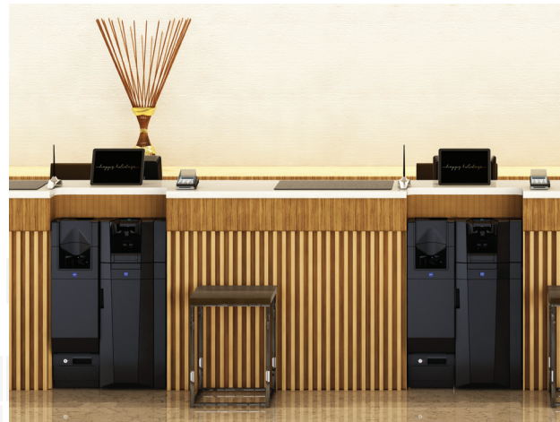
2. Large volume of cash CI-50B/CI-10CX