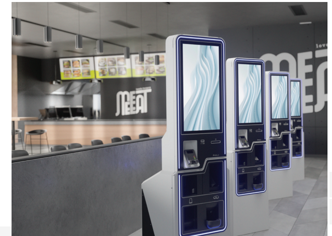
3. Small volume of cash with integrated kiosk C27