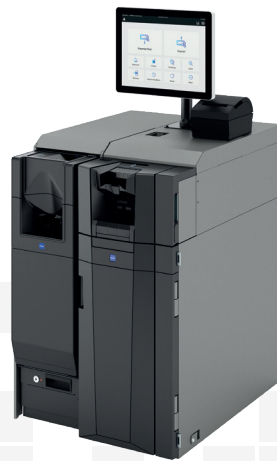
2. Small volume of cash CI-10CX/CI-50B