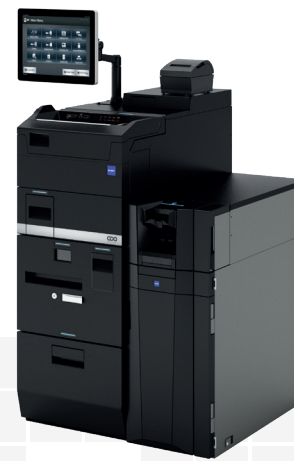
3. Mid volume of cash CI-100CX/CI-50B