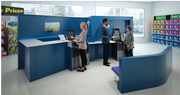
SHARED BANK BRANCH