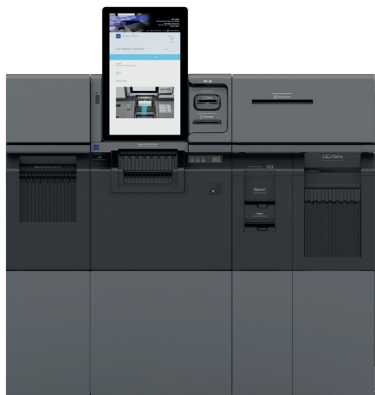
TYPE D Compact note recycler Loose coin recycler Rolled coin dispenser Letter statement printer/check acceptor*