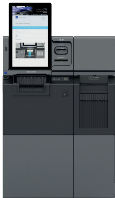
TYPE B Compact note recycler Check acceptor or loose coin recycler