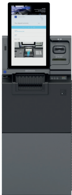
TYPE A Compact note recycler