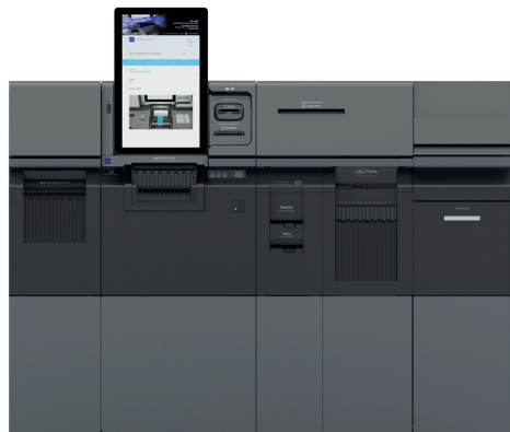
TYPE E Compact note recycler Loose coin recycler Rolled coin dispenser Drop-box Letter statement printer/check acceptor*