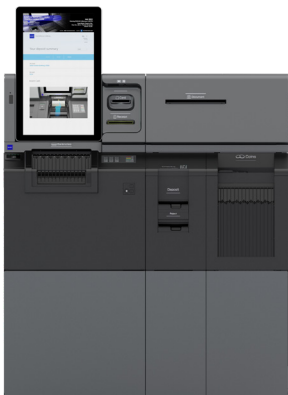
TYPE C Compact note recycler Check acceptor Loose coin recycler Letter statement printer*