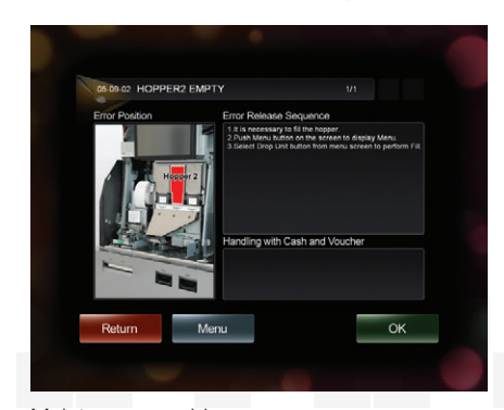
Maintenance guidance screen