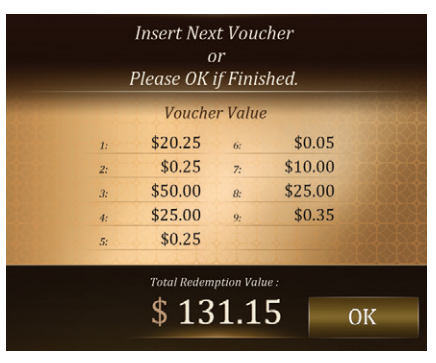
Multiple-voucher processing screen

The SK-500 is fully compliant with the ADA-2010 standards, ergonomically designed with interface functions and peripherals positioned to meet accessibility standards for users with disabilities. In addition, the SK-500 also fully conforms to PCI version 3.0 security specifications.