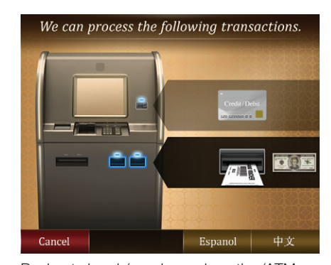
Banknote break/voucher redemption/ATM