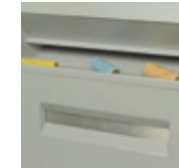
Rolled coin delivery