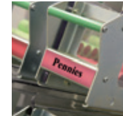
Coin rolls picked