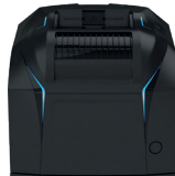
Output Shutter (option for HS model)