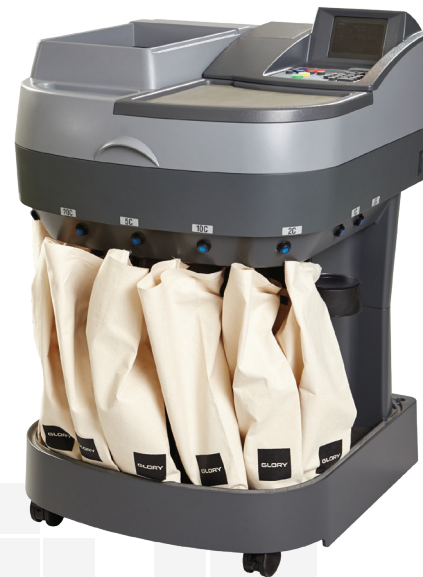
Mach™ 9e WAVE™

Mach™ 9e WAVE™ – The Mach 9e WAVE is a high-speed coin sorting machine that can be used to process large amounts of coins. It is specially designed for coin processing centres where throughput and reliability are the primary concerns. The Mach 9e WAVE is ideal for finance offices, vending machines, transport companies and casinos. It offers the highest levels of precision and productivity for cash offices in the leisure industry.