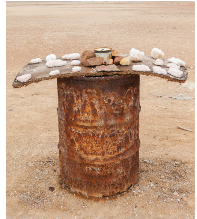
Salt crystals for sale by the side of the road using 'honesty boxes' to collect money.

Epupa's CIT service collects bulk cash funds each month from the banks as approved by the government, which are then loaded into its SmartPay ATMs – each of which is transported across Namibia enduring some of the harshest long distance travel conditions of any automated cash, such as extreme vibration, humidity and heat – the kind of conditions that overwhelm standard, commercial ATMs. Epupa manages several field teams on the road for more than 3 weeks out of each month using 18 to 25 SmartPay devices at any one time, each conducting up to 15,000 transactions during that period – and the process is then repeated the following month.