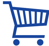
Grocery Mass Merchants Speciality Shops