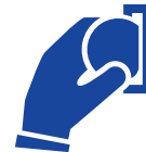
Parking Authorities Vending