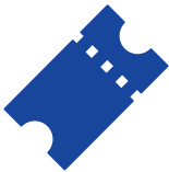
Sports Arenas Amusement Theatres