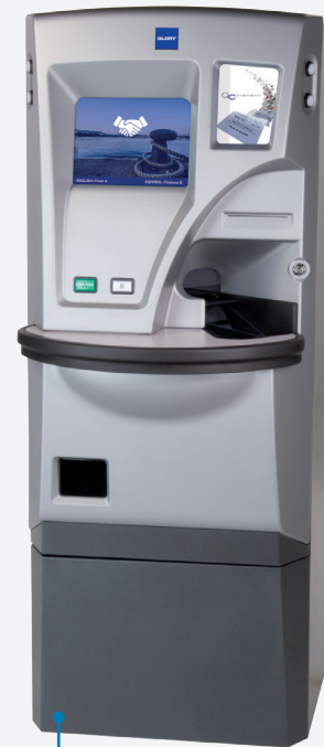
QC Mixed coin bins

Offering your customers a faster, more convenient way to deposit coin reduces waiting times, improves teller productivity and enhances customer satisfaction. QC is an automated, self-service coin deposit solution. Your customers can quickly and easily deposit their coins without the need to pre-sort, wrap, sachet or wait in line for a teller.